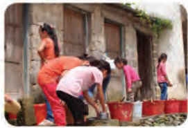
優化板蘭小學的洗澡房 Improve BanLan primary school the shower room.