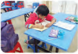
孩子在明亮的自修室裡做作業 Children can do home-works in a room with enough light.