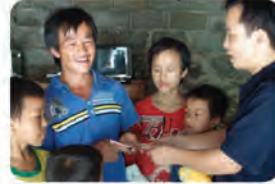
定期給山區孤兒發放生活補助及緊急藥箱 Regular visit the orphans in the village and deliver subsides and emergency medications.