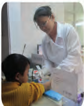
給孩子每年進行一次身體健康全面體檢 發放日常生活、學習用品 Regular physical checkup and deliver daily supply and stationaries.