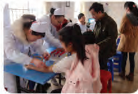
醫生們來到中心，給孩子們進行健康檢查 Doctors came to the center to do physical exam for the children.