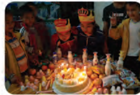
關愛中心生日派對 Birthday Party at the Caring Center