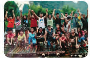
豐富的課餘活動 After School Activities