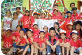
成績優異的山區學生到南寧旅行 A field trip to Nanning for the students with honor grades.