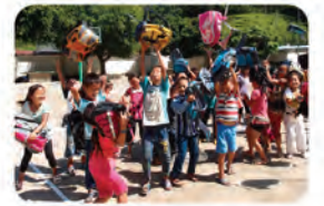
感謝香港有心人事捐贈的二手書包！ Thanks everyone in Hong Kong for the school bags donations!