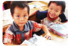
學生們開心收到開學禮包 Students are happy to receive gift for the first day of school.