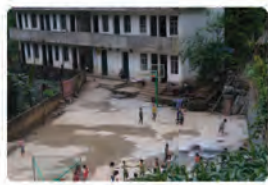
為可考小學安裝新的籃球架 Installation of a new basketball stand for Ke Kao Elementary school