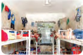
宿舍電風扇，夏天很涼快！ Feeling cool with the new fans during summer!